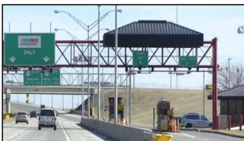
Oklahoma Transportation Authority Turnpike System