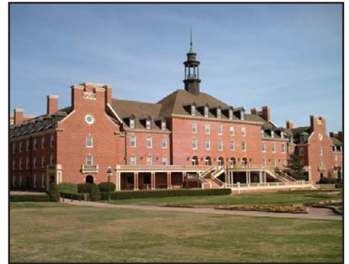
Oklahoma State University, Stillwater

Our lives are enriched by services and conveniences we enjoy every day. Many of these benefits were paid for by the issuance of municipal bonds. Municipal bonds are issued to build roads, schools, hospitals, and many other structures that improve the communities in which we live. In addition to enhancing our quality of life, many investors have found municipal bond mutual funds to be a valuable addition to their investment portfolio.