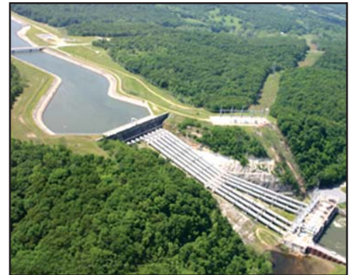
Grand River Dam

We select municipal bonds for the Fund based upon an assessment of a bond's relative value in terms of current yield, price, credit quality, maturity, and future prospects. We review municipal securities available for purchase, monitor the continued creditworthiness of the Fund's municipal investments and analyze economic, political, and demographic trends affecting the municipal markets. Based on our analysis of this research, we will select those municipal obligations that we believe represent the most attractive values.