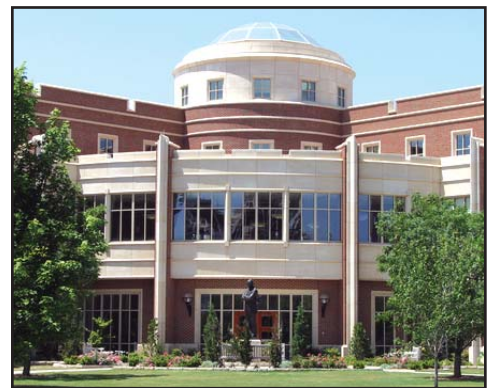
University of Oklahoma, Norman