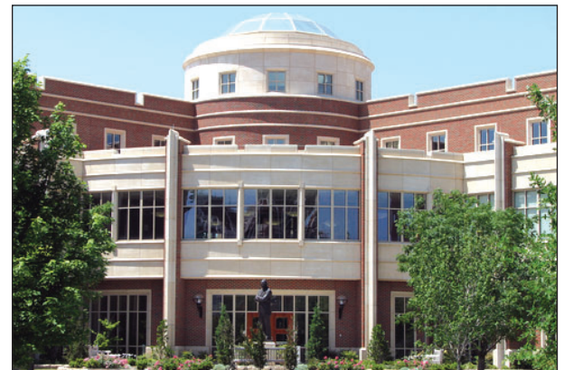
University of Oklahoma - Norman, OK