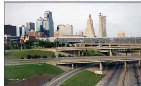
Kansas City Skyline and Roadways