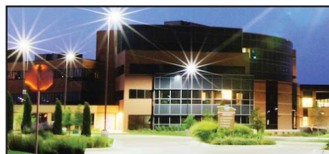
Hays Medical Center - Hays