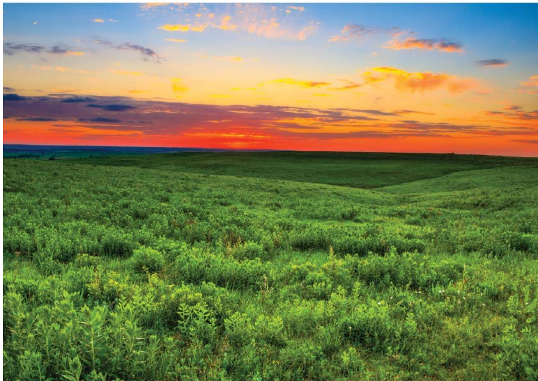
Sunset over the Kansas Flint Hills