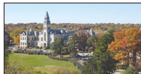
Kansas State University - Manhattan