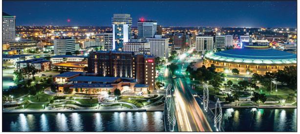
Wichita, KS - Cityscape