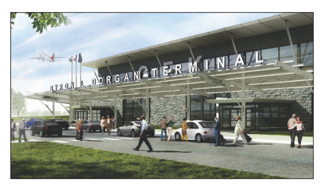
Grand Forks International Airport - Grand Forks, ND