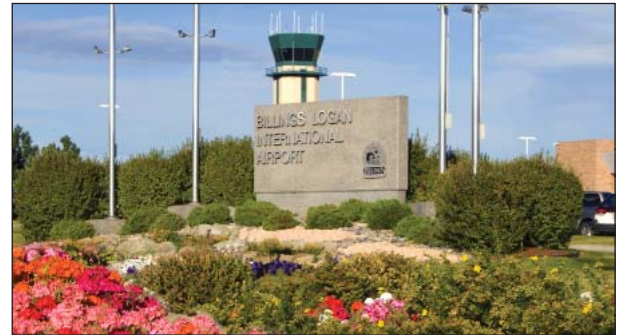
Billings, MT Airport

The relative scarcity of individual Montana municipal bonds can make it difficult for individual investors to obtain the best prices. The Viking Tax-Free Fund for Montana's market presence helps enable us to find bonds in appropriate sizes at attractive rates.