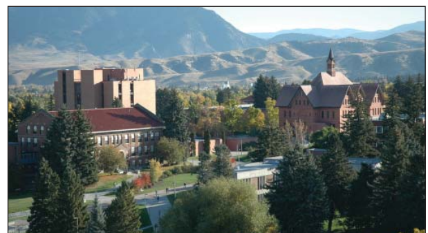
Montana State University - Bozeman, MT

We select municipal bonds for the Fund based upon an assessment of a bond's relative value in terms of current yield, price, credit quality, maturity, and future prospects. We review municipal securities available for purchase, monitor the continued creditworthiness of the Fund's municipal investments and analyze economic, political, and demographic trends affecting the municipal markets. Based on our analysis of this research, we will select those municipal obligations that we believe represent the most attractive values.