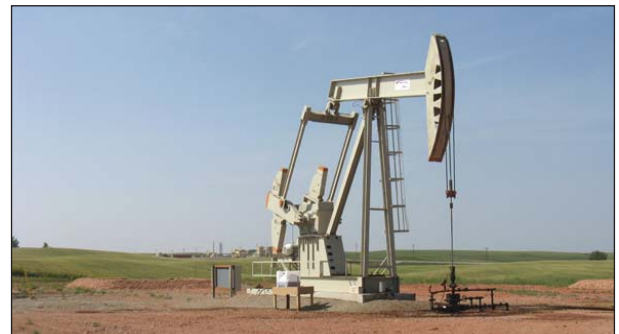
Oil production in Eastern Montana