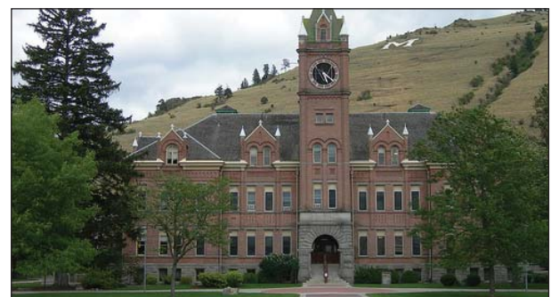
University of Montana - Missoula, MT

The Fund primarily purchases municipal bonds that are rated investment grade by independent ratings agencies at the time of purchase. The Fund may buy non-rated municipal bonds if the investment manager deems them to be of investment grade equivalent.