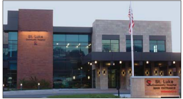
St. Luke Healthcare - Ronan, Montana

O ur lives are enriched by services and conveniences we enjoy every day. Many of these benefits were paid for by issuing municipal bonds. Municipal bonds are issued to build roads, schools, hospitals, and many other structures that improve the communities in which we live. In addition to enhancing our quality of life, many investors have found municipal bond mutual funds to be a valuable addition to their investment portfolio.