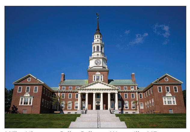
Miller Library at Colby College - Waterville, ME