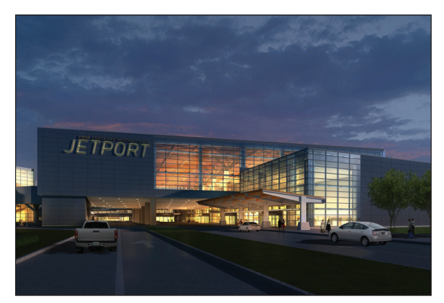
Airport Terminal Expansion - Portland, ME