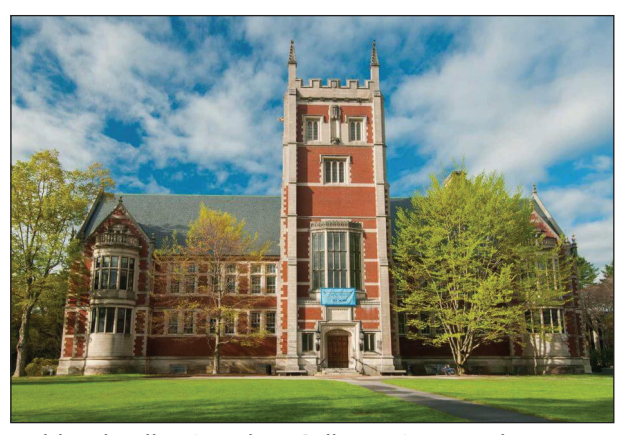
Hubbard Hall at Bowdoin College - Brunswick, ME

The Fund primarily purchases municipal bonds that are rated investment grade by independent ratings agencies at the time of purchase. The Fund may buy non-rated municipal bonds if the investment manager deems them to be of investment grade equivalent.