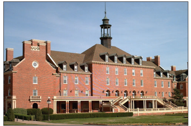
Oklahoma State University - Stillwater, OK

The Fund primarily purchases municipal bonds that are rated investment grade by independent ratings agencies at the time of purchase. The Fund may buy non-rated municipal bonds if the investment manager deems them to be of investment grade equivalent.