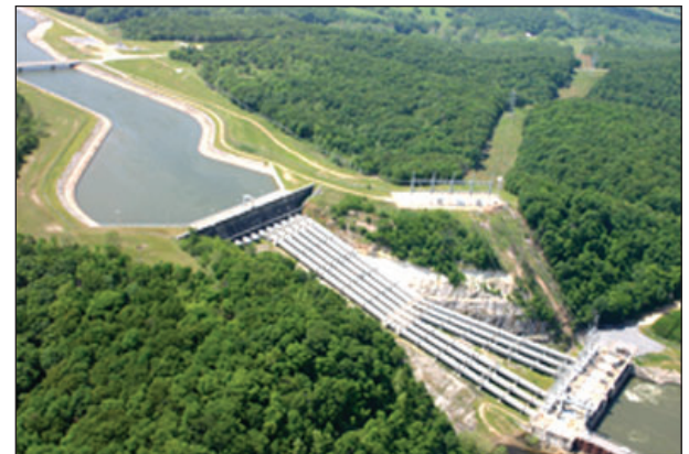
Grand River Dam