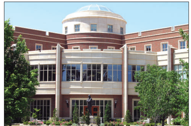
University of Oklahoma - Norman, OK